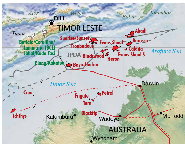
Figure 2: Timor Sea oil and gas infrastructure

Canberra regards any softening in its stance on maritime boundaries as political folly that would leave its maritime agreements with other neighbouring territories open to dispute. DE