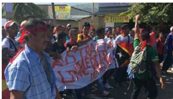
East Timorese protest outside the Australian Embassy in Dili in March.

Like the article? Subscribe (https://www.greenleft.org.au/subscribe/details) to Green Left now! You can also like (https://www.facebook.com/greenleftweekly) us on Facebook and follow us (https://twitter.com/greenleftweekly) on Twitter.