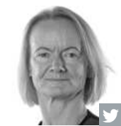
by Angela Macdonald-Smith

An unexpected breakthrough in the sea boundary dispute between Australia and Timor-Leste has resurrected hopes that Woodside Petroleum will be able to kickstart the stalled development of its $US13 billion Sunrise LNG project.