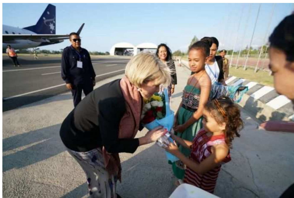
PHOTO: Foreign Minister Julie Bishop accepts flowers after arriving in East Timor.