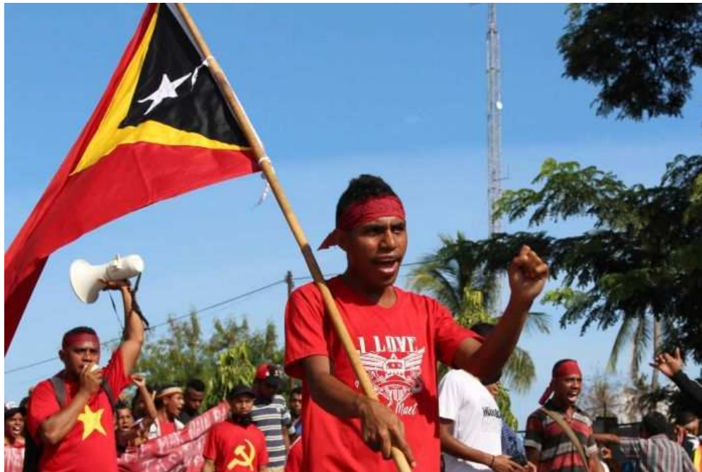
PHOTO: One of the protesters holds an East Timor flag as he marches.

Protesters flocked to the Australian Embassy in Timor to voice their anger, while Dili and Canberra faced off in the Conciliation Commission and the Permanent Court of Arbitration in the Hague.