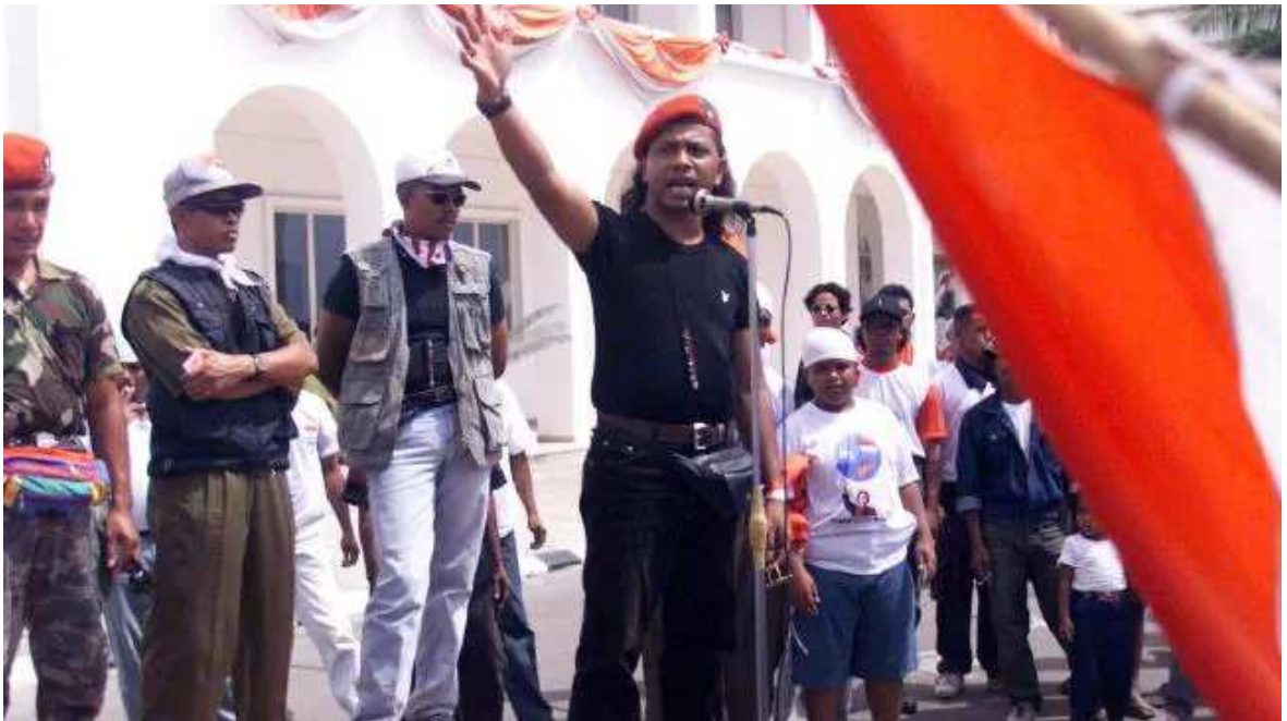
Eurico Guterres in 1999.