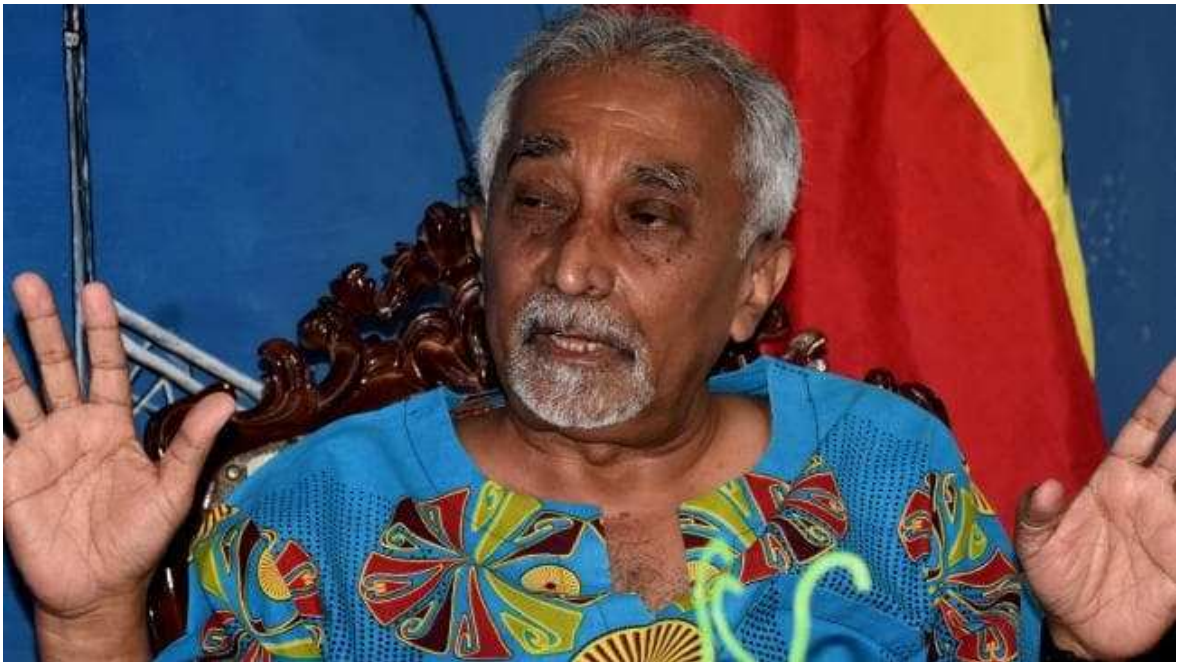
Dr Mari Alkatiri.

Not everyone is happy about it, however. Former prime minister Mari Alkatiri, who negotiated the first Timor Sea resource-sharing agreement with the Howard government, says East Timor did not do as well as it should have from the new deal and that Canberra again bested Dili by conflating the sovereign border issue with commercial negotiations.