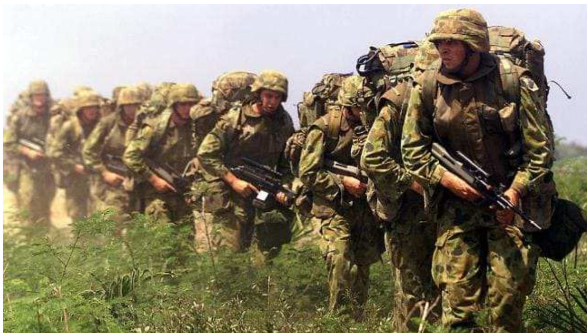
Australian soldiers moving out from Dili Airport after flying in from Darwin on an international peacekeeping mission in 1999.

Dili is sparkling ahead of the celebrations, including cultural performances, conferences on transitional justice for thousands of victims of violence before, during and after the occupation, and the opening of a bridge controversially dedicated to former Indonesian president BJ Habibie, who, under pressure from Australia and the UN, allowed Timorese to vote on their future on August 30, 1999.