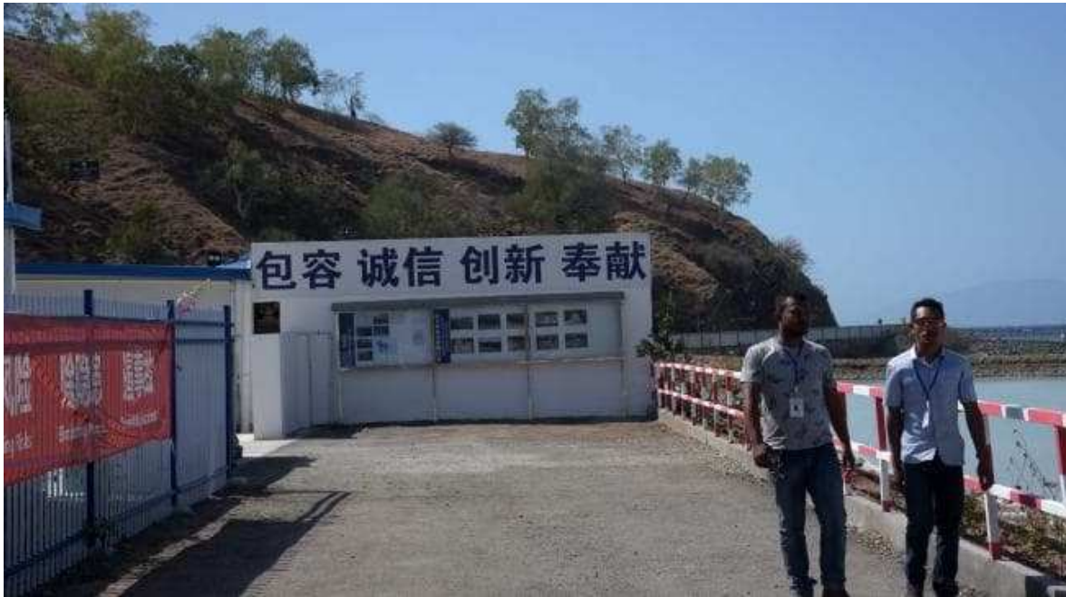
The Tibar Bay Port project, west of Dili, being built by China Harbour Engineering.

Another state-owned Chinese company, China Civil Engineering Construction Corp, will finance and build the $US943m Beaco Port on East Timor's south coast — 700km from Darwin — under a contract awarded by East Timor's oil and gas company, TimorGAP.