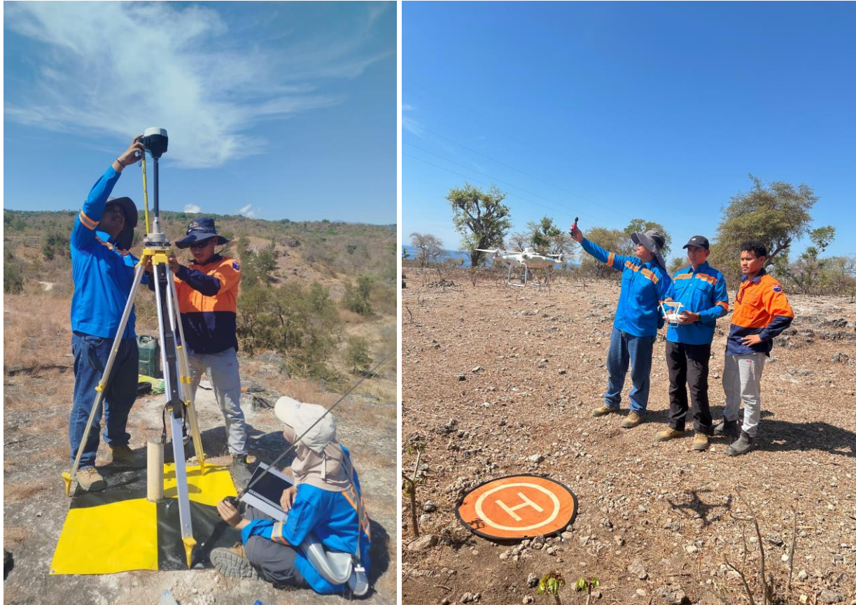
Figure 3: LEFT: Establishing one of several survey control points RIGHT: Drone testing prior to the start of surveying at Werumata

The ability for LiDAR to detect not only current topographical lows but also signs of historical structures is anticipated to enhance the Company's predictive modelling for the locations of these secondary manganese occurrences.