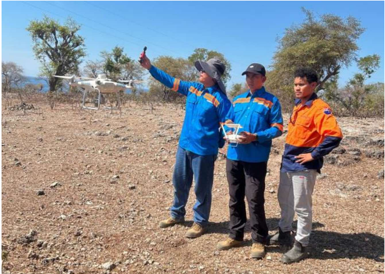
Estrella Resources' field team testing the drone before beginning the survey at Werumata.

E strella Resources has initiated a comprehensive survey program across its Timor-Leste concessions, targeting its highly prospective manganese and limestone deposits in the Lautém Municipality.