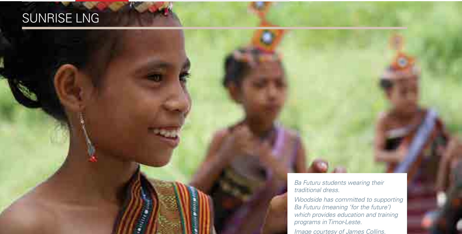
Ba Futuru students wearing their traditional dress. Woodside has committed to supporting Ba Futuru (meaning 'for the future') which provides education and training programs in Timor-Leste.

Woodside and the Sunrise Joint Venture are actively engaging with both the Timor-Leste and Australian governments to achieve an aligned development outcome for Greater Sunrise.