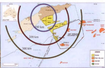
Area of service Suai Supply Base