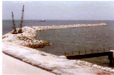
Ezemplu Imajen Breakwater