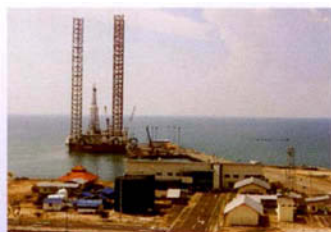
Ezemplu Imajen Supply Base