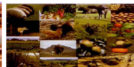
Ezemplu Imajen Atividades Supply Base