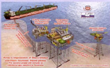
Fasilidade Produsaun mina Bayu - Undan iha Tasi Timor