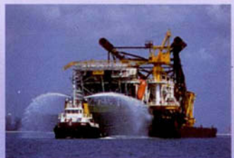
Transporta husi Supply Base ba fatin esplorasun & Produsaun