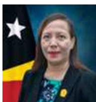
Minister of Finance