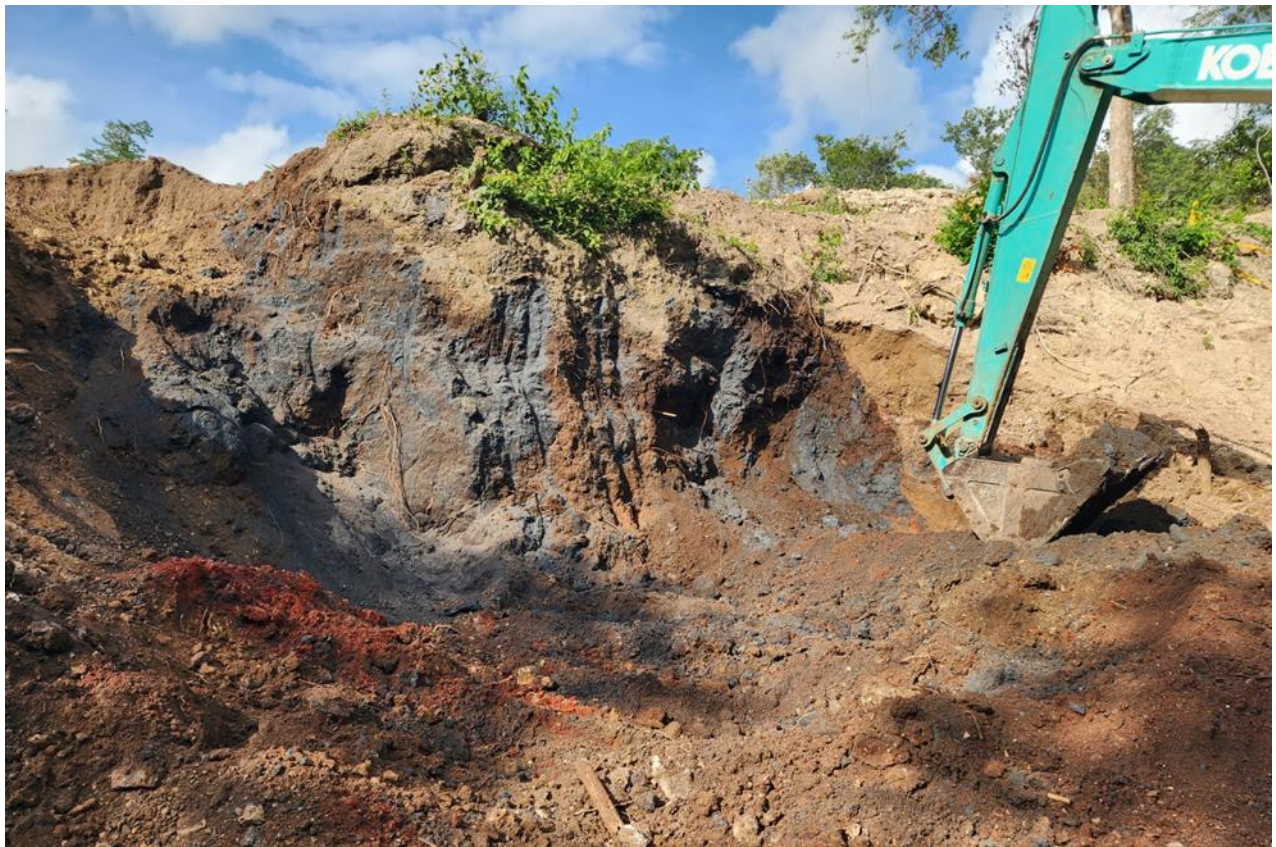
Figure 2: manganese ore previously intersected by EMDD001 and EMDD002 being extracted during Ira Miri pit excavation 1

The manganese-bearing mineralised horizon, which has been tested by numerous drill-holes completed in 2025 (assay results reported 4 September 2025 “ Assays received and further Manganese intersected drilling ”) 1 has been successfully intercepted as part of pit excavation activities, validating the Company’s exploration model and providing further confidence in project development (Figures 1 & 2).