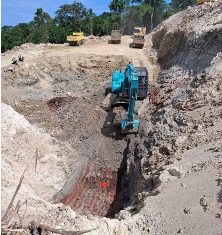
Figure 3: Exposure of manganese bearing red clay interpreted to overlie main mineralised zone (see Figure 4) within excavation 2

Current excavation progress (Figure 3) has penetrated the distinctive red-brown layer that is associated with the manganese mineralisation (refer to Figure 1), in which there is also some manganese mineralisation present as thin layers of manganese oxides and manganese enrichment in the clay itself, as demonstrated by reported drilling results for several drill-holes in which red-brown clay and manganese oxides are interbedded (e.g., EMDD033, EMDD034 and EMDD038, reported 18 December 2025 “High Grade Ira Miri Mn Assays”). 2