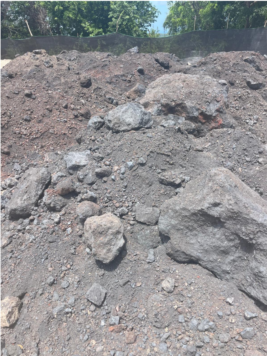
Figure 5: initial ore, sourced from the zone intersected by EMDD001 and EMDD002, in manganese pithead stockpile area at Ira Miri 1

Following confirmation of an optimised extraction sequence, excavation activities are anticipated to accelerate, with the pithead Stage 1 stockpile area already receiving initial manganese ore (Figure 5).