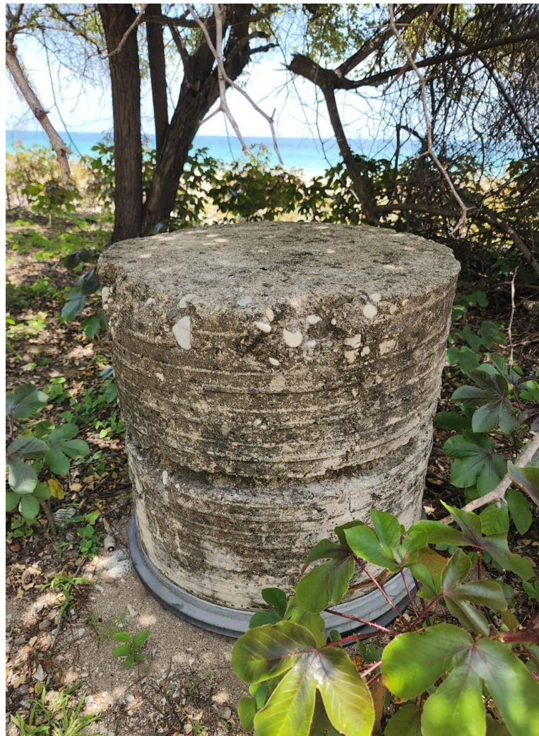
Figure 7: Tenu beach port site location with anchor point

With the market sample extraction progressing at a rapid pace, the Company has elevated its discussions with several potential international end-users. Negotiations with a range of prospective buyers continue to advance and the Company will keep shareholders informed on material developments.