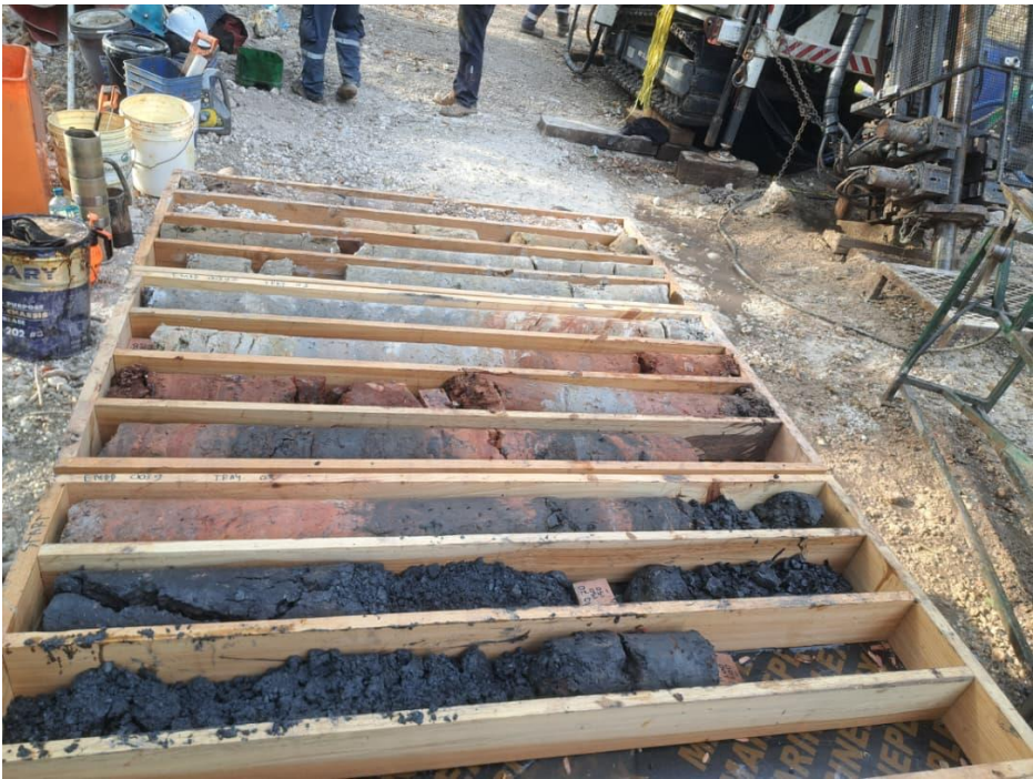
Figure 4: Manganese bearing red clay overlying main mineralised zone in EMDD039 2