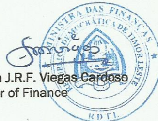
Santina J.R.F. Viegas Cardoso Minister of Finance