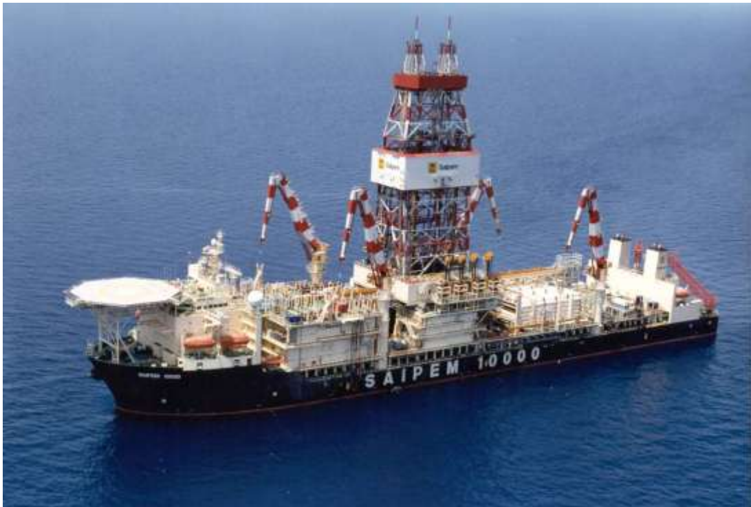
Figure ES.2 Saipem 10000 .

Cova-1 is planned to be drilled in September 2010 as a vertical exploration well. Drilling will be undertaken using the drillship, Saipem 10000 (Figure ES.2). On arrival at site, the drillship will move into position and remain in position using the Class III Dynamic Positioning system.