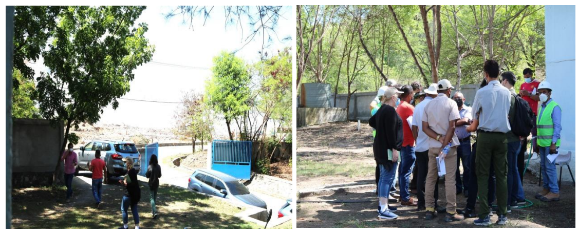
CDT-TL and MoSA conducted site visit Tibar landfill 14th of October 2022

On October 13, 2022, CDT and BTL conducted a meeting with the National Directorate of Urban planning of the MoSA, Consulting supervisor for the DSWP project including the Project Management Unit of DSWP at the meeting room of MoSA. The objective of the meeting was to clarify the agreement between MCC and the GoTL on the use the Tibar landfill site as a final destination for sludge disposal. In addition, the meeting was also to convey to the technical team of MoSA and DMA in order to provide the technical point of view to the Minister of State and Administration before approving the sanitary landfill in Tibar to that will accumulate the biosolid treatment from the WWTP in Bebonuk. Furthermore, there was a site visit to Tibar Landfill area which was organized by CDT and MoSA on 14<sup>th</sup> of October 2022 in order to observe the site condition and the plan to redevelop that area based on the project under the responsibility of MoSA and DMA.