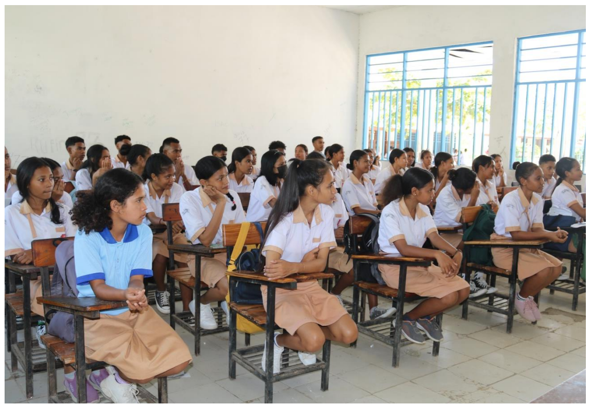
CDT-TL and MCC visited classroom and interact with students from Ensino Secondaria Geral (ESG) 4 Setembru UNAMET Balide on July 20, 2022