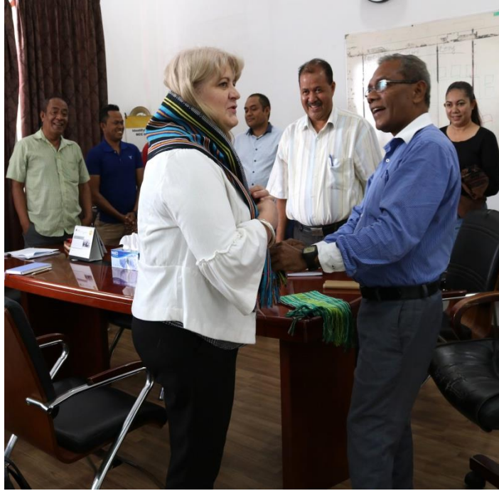
to meet with all CDT team on May 20, 2022