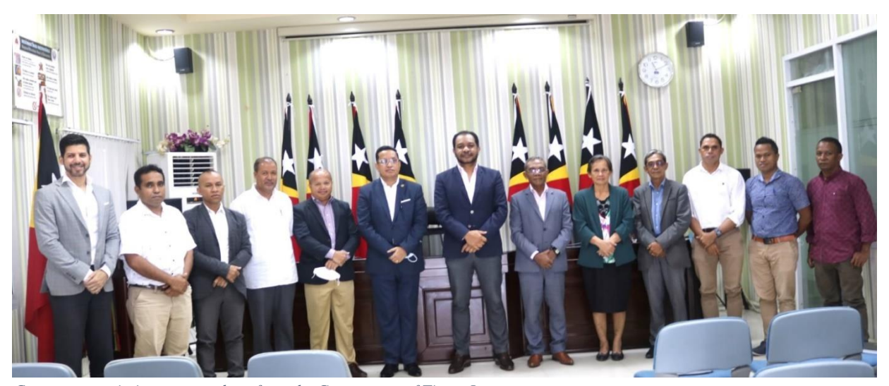
Compact negotiation team mmbers from the Government of Timor-Leste

This 5 years assistance package estimated at US$484.000.000,00 which consist of US$ 420.000.000,00 made available by the MCC, together with US$64.000.000,00 contribution made available by the Government of Timor-Leste.