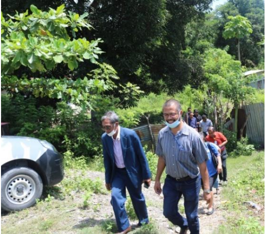
CDT-TL with resentatives from MEYS, MHESC, UNTLConducted Site Visit to the UNTL property in Hera on March 30, 2022

In April, prior to a trip to Washington for the Compact negotiation with MCC, UNTL had issued a letter of dispatch for the use of the land in Hera for the CoE building construction. The letter that was attached with a map of the site has been handed over to the CDT-TL for its reference. Consequently, Minister Longinhos dos Santos of MHESC has written a letter and sent it to the Ministry of Justice requesting the entitlement of the land for CoE. Up to the time of the writing of this report, however, the Ministry of Justice has not replied to the letter. Regardless, GoTL's (through MHESC and MEYS) decision to provide a strategic space for the CoE construction was critical for MCC as it demonstrated the Timorese government's seriousness about the TALENT project moving forward. More about the land acquisition and entitlement will be discussed in the next CDT-TL's annual report.