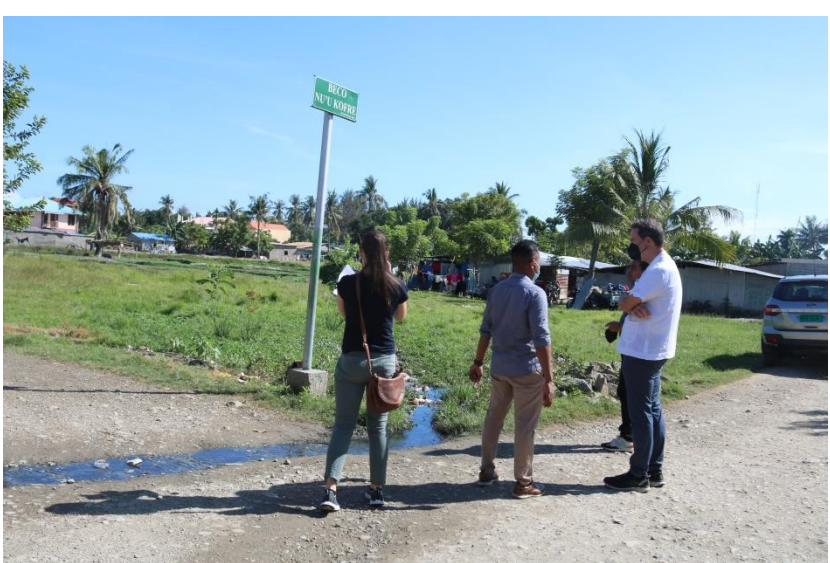
CDT-TL and MCC conducted WSD Site Visit and interviewed with people potentially affected by the investment in Fatuhada/Dili on July 20, 2022