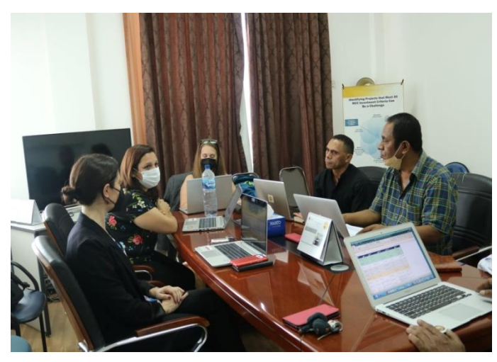
MCC-Education and SBC meeting with CDT-TL on June 6, 2022

Apart from ensuring quality and access, in consultation between CDT-TL and MCC Washington, has discussed and proposed Gender and Social Inclusion component include gender analysis to the secondary education system which is focused on 'girls' participation in the secondary education system & Inclusivity, challenges for women to become school's leaders, as well as challenges of female teachers in career development.