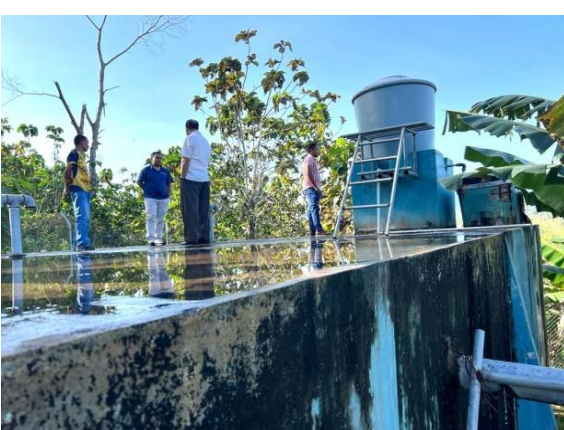
CDT-TL conducted site visit to the clean water treatment station in Viqueque, on August, 2022

The president of municipal authorities and the BTL directors of the four municipalities stated above were appreciative of the visit and express their full support to the WSD project especially the intiative to have our own sodium hypochlorite production because it will help BTL in these municipalities to treat the water before distributing it to the community. Furthermore, CDT-TL directly oversaws and heard of the difficulties faced by the BTL in providing the clean water local authorities in serving the communities. Additionally, CDT-TL aslo found out that there are lack of facilities for water treatment and the public water supply sources in these municipalities.