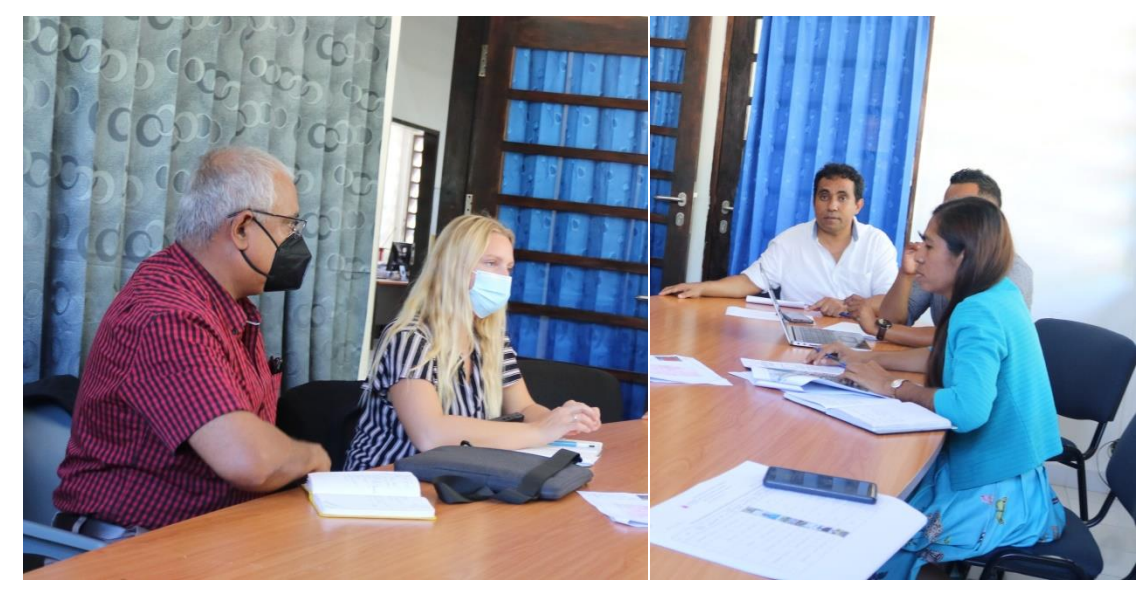
MCC-CDT meeting with DNTPSC Director on October 5, 2022

the conventional and simplified sewer line. In October 3, 2022, the CDT-TL team together with MCC's contractor for the FS project Tetra Tech met with National Director of Cadastral Office and her technical team to obtain the information of details cadastral maps such as, property boundaries, roads and footpaths from the area where sanitation project activity will be implemented.