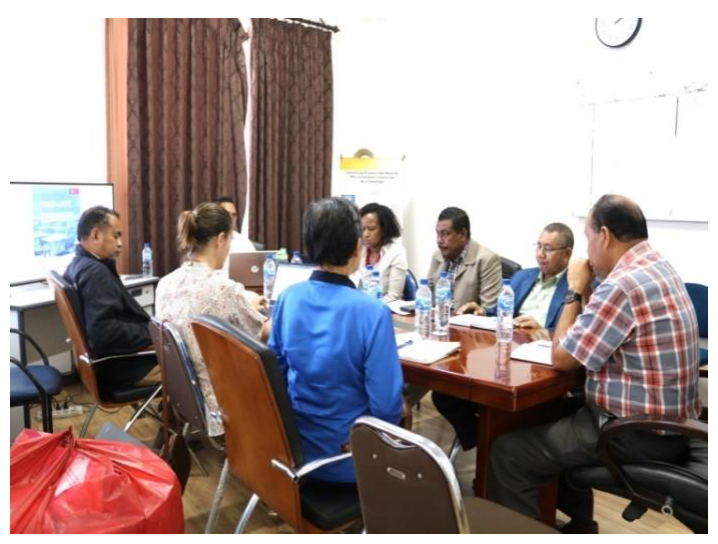
CDT-TL meeting with the Technichal Review Committee (TRC) members on October 12, 2022

Thus, based on the changes made, CDT-TL presented the education project to the Council of Ministers on February 16<sup>th</sup> where a number of issues were discussed including both Ministries (MEYS & MHESC)'s commitment to providing a temporary space for the teachers and school leaders training while the CoE building is under construction and made available a piece of land for the construction of the CoE building in Hera.