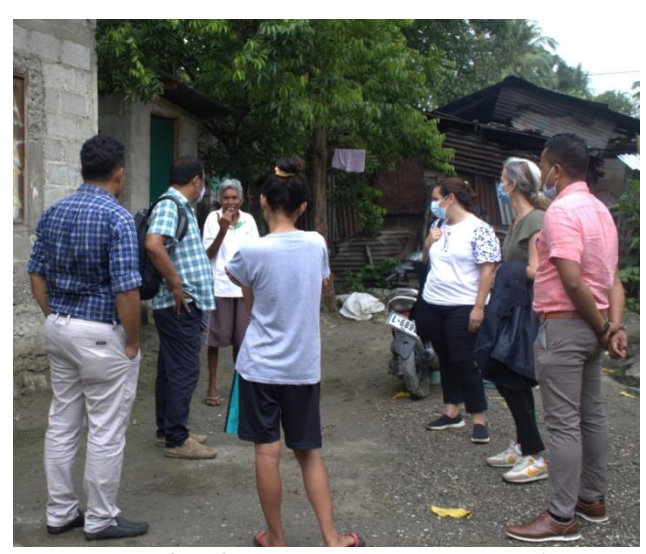
MCC-CDT conducted SBC Assestment in Bairopite Dili June 2022

Social Behavior Change (SBC) is a component of the Water Sanitation and Drainage Project of MCC Investment. Even though the infrastructure construction is only centered in Dili, this project will also provide benefits in several municipalities such as Ermera and Bobonaro, and then expand to other municipalities in the coming years. Therefore, during 2022, CDT-TL has conducted assessments to the Municipalities including Manatuto, Baucau, Lautem and Viqueque, Liquisa, etc. The purpose of this assessment is to identify community habits in managing drinking water at the household level and community