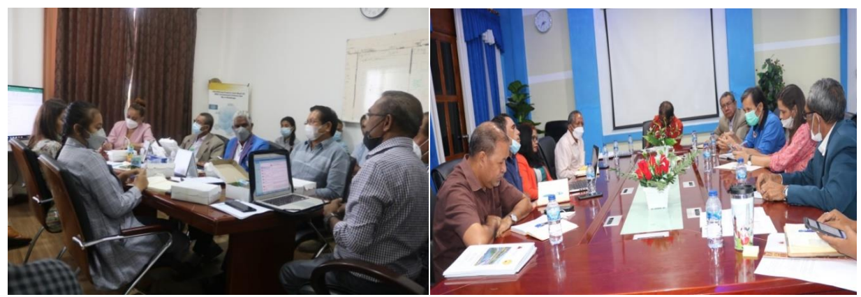
Focal point meeting on WSD Project in May 17, 2022

CDT-TL conducted its first focal point meeting on February 3, 2022. The meeting was conducted in order to update information on the compact development process and discussed the preparation and time line for compact agreement negotiation between the Government of Timor-Leste and USA-MCC. During the meeting the CDT-TL presented results of feasibility studies on Water treatment, sanitation and drainage program and education TALENT Project.