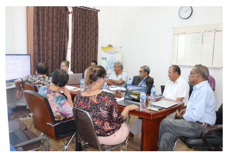
CDT-TL meeting with the Technichal Review Committee (TRC) members on January 12, 2022

By late November 2021 the International Business Firm (IBF) had received comments and feedback from MCC and GoTL on the first draft of the education project design study. During a Mission to Timor-Leste November 2021. IBF presented the first draft of the IDM to the GoTL namely the Ministry of Education Youth and Sport (MEYS) and the Ministry of Higher Education, Science and Culture (MHESC). Critical comments and recommendations were made to the documents and