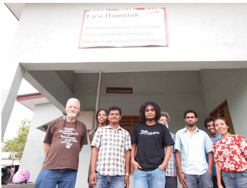
Figure 1. The author with La'o Hamutuk advocates and researchers in November 2013.