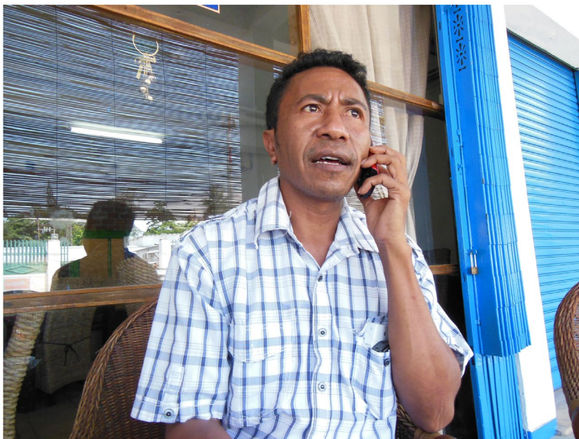
Figure 5. Investigative journalist and Tempo Semanál publisher José Belo – struggling for greater transparency in governance and a free press.

agricultural imports unless there is an unavoidable need.